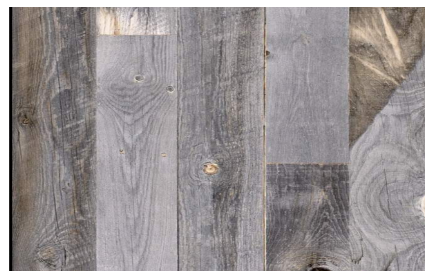
ACCENT RECLAIMED SIDING