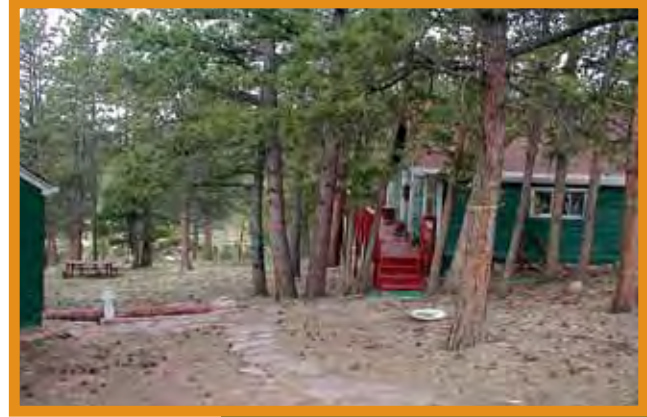
Figure 11: Homesite before defensible space.

Zone 3 is the area farthest from the home. It extends from the edge of Zone 2 to your property boundaries.