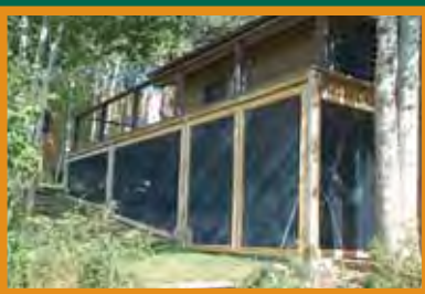
Figure 16: Enclosing decks with metal screens can prevent embers from igniting a house.