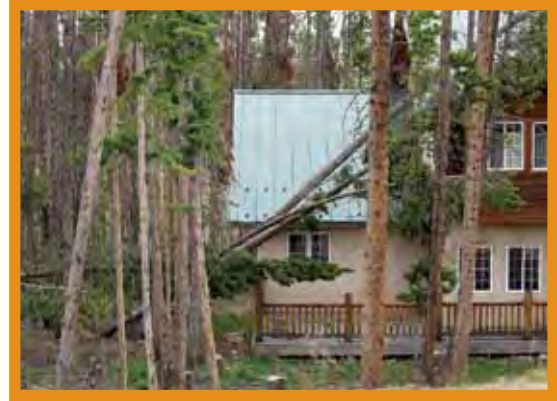
Figure 21: During high winds, these lodgepole pine trees fell onto the house. Lodgepole pine is highly susceptible to windthrow.

To ensure a positive response to thinning throughout the life of a lodgepole pine stand, trees must be thinned early in their lives – no later than 20 to 30 years after germination. Thinning lodgepole pine forests to achieve low densities can best be