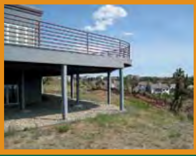
Figure 14: This homeowner worked hard to create a defensible space around the home. Notice that all fuel has been removed within the first 5 feet of the home, which survived the Waldo Canyon Fire in the summer of 2012.

Zone 2 is an area of fuels reduction designed to diminish the intensity of a fire approaching your home. The width of Zone 2 depends on the slope of the ground where the structure is built. Typically, the defensible space in Zone 2 should extend at least 100 feet from all structures. If this distance stretches beyond your property lines, try to work with the adjoining property owners to complete an appropriate defensible space.