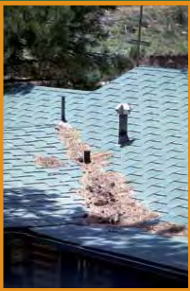
Figure 15: Clearing pine needles and other debris from the roof and gutters is an easy task that should be done at least once a year.