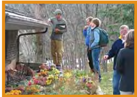
Figure 27: Sharing information and working with your neighbors and community will give your home and surrounding areas a better chance of surviving a wildfire.