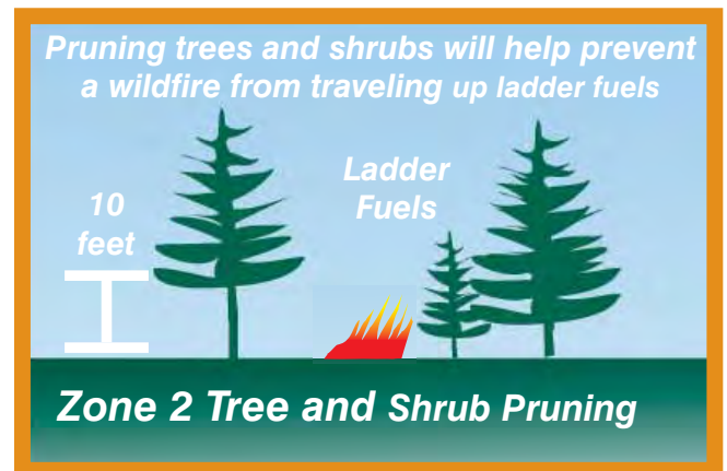
Figure 18: Pruning trees will help prevent a wildfire from climbing from the ground to the tree crowns.