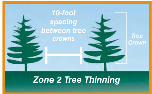
Figure 17: In Zone 2, make sure there is at least a 10-foot spacing between tree crowns.