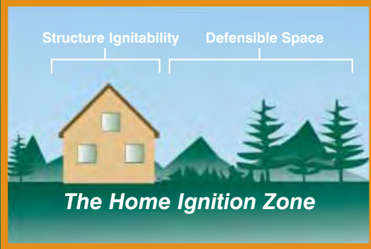
Figure 7: Addressing both components of the Home Ignition Zone will provide the best protection for your home.

Two factors have emerged as the primary determinants of a home's ability to survive a wildfire – the quality of the defensible space and a structure's ignitability. Together, these two factors create a concept called the Home Ignition Zone (HIZ) , which includes the structure and the space immediately surrounding the structure. To protect a home from wildfire, the primary goal is to reduce or eliminate fuels and ignition sources within the HIZ.