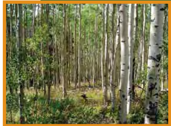
Figure 22: Mature aspen stands can contain many young conifers, dead trees and other organic debris. This can become a fire hazard.