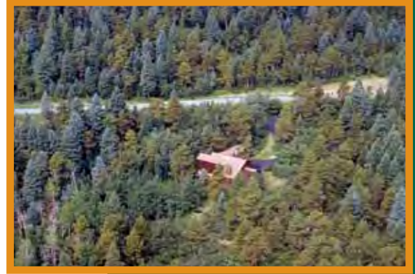
Figure 28: This house has a high risk of burning during an approaching wildfire. Modifying the fuels around a home is critical to reduce the risk of losing structures during a wildfire.