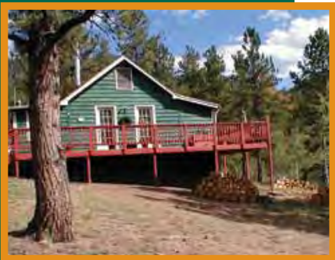
Figure 10: Decks, exterior walls and windows are important areas to examine when addressing structure ignitability.