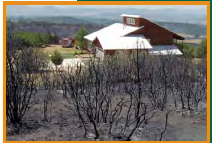
Figure 30: Firefighters were able to save this house during the 2012 Weber Fire because the homeowners had a good defensible space.