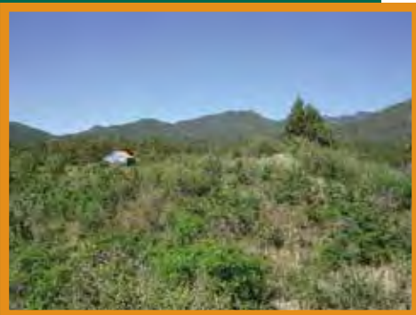
Figure 25: Gambel oak needs to be treated in a defensible space at least every 5-7 years because of its vigorous growing habits.

accomplished by beginning when trees are small saplings, and maintaining those densities through time as the trees mature.