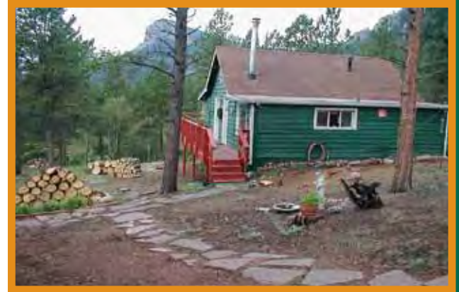
Figure 12: Homesite after creating a defensible space.