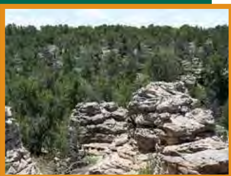
Figure 24: Piñon-juniper forests are often composed of continuous fuels. Creating clumps of trees with large spaces in between clumps will break up the continuity.

The defensible space guidelines in this quick guide are predominantly for ponderosa pine and mixed-conifer forests. These guidelines will vary with other forest types.