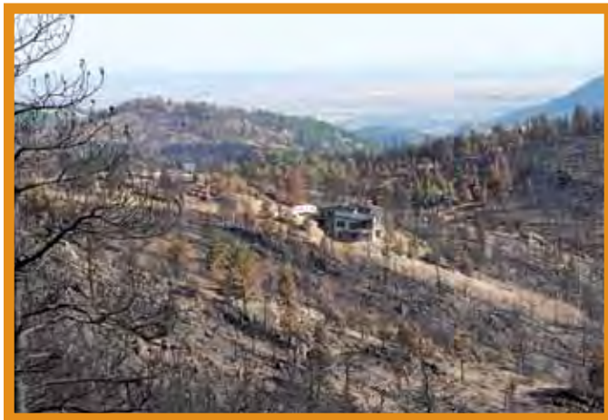
Figure 29: This house survived the Fourmile Canyon Fire in 2010.