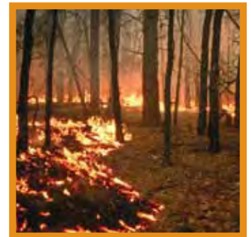
Figure 5: Surface fuels include logs, branches, wood chips, pine needles, duff and grasses.