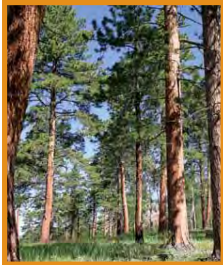
Figure 20: This ponderosa pine forest has been thinned, which will not only help reduce the wildfire hazard, but also increase tree health and vigor.