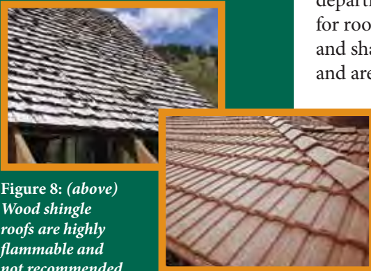
Figure 8: (above) Wood shingle roofs are highly flammable and not recommended.

This guide provides only basic information about structural ignitability. For more information on fire-resistant building designs and materials, refer to the CSFS FireWise Construction: Site Design and Building Materials publication at www.csfs.colostate.edu .