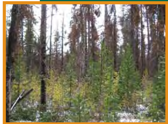
Figure 23: A young lodgepole pine stand. Thinning lodgepole pines early on in their lives will help reduce the wildfire hazard in the future.