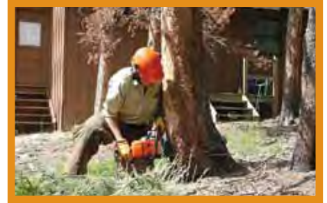
Figure 26: Keeping the forest properly thinned and pruned in a defensible space will reduce the chances of a home burning during a wildfire.