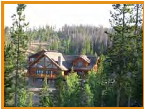
Figure 2: Colorado's grasslands, shrublands, foothills and mountains all have areas in the wildland-urban interface where human development meets wildland vegetative fuels.

to reduce fire hazards within and adjacent to communities. This includes treating individual home sites and common areas within communities, and creating fuelbreaks within and adjoining the community where feasible. This document will focus on actions individual landowners can take to reduce wildfire hazards on their property. For additional information on broader community protection, go to www.csfs.colostate.edu .