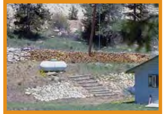
Figure 19: Keep firewood, propane tanks and natural gas meters at least 30 feet away from structures.