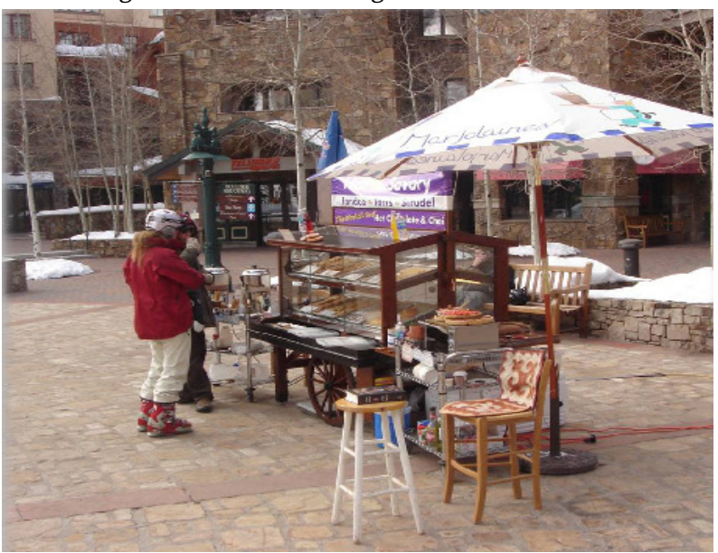
Figure 28. Vending carts that are not self-contained are not allowed.