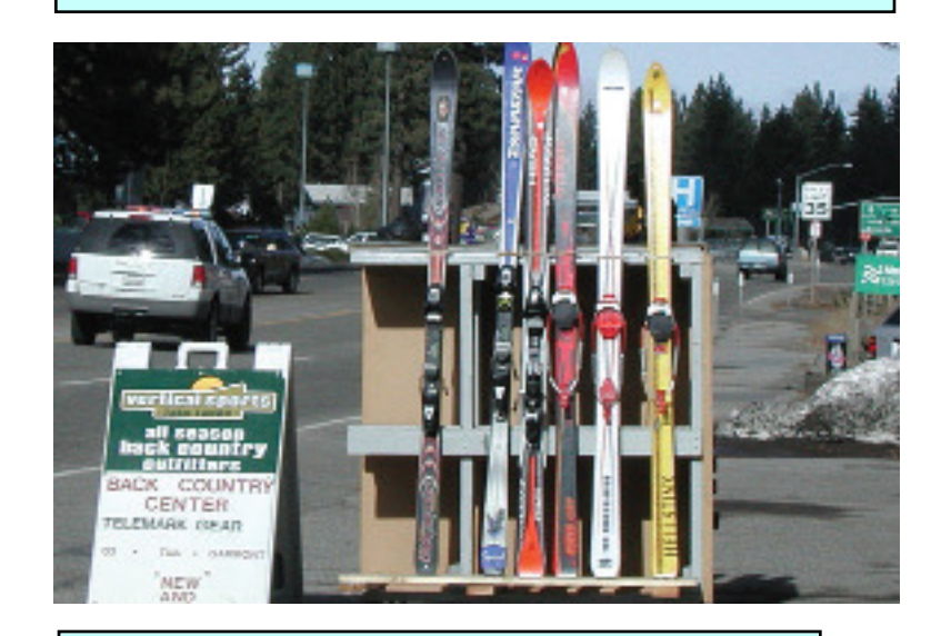
Figure 40. Ski valets shall be moveable and have an effective display such as above.