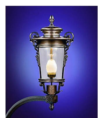
Figure 33. Wall mounted Mediterraneanstyle light that is permissable with opaque glass.