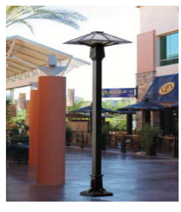
Figure 35. Permissible freestanding contemporary fixture.