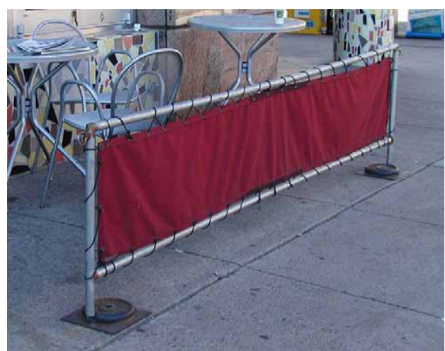
Figure 7. Fabric inserts to be used as part of a Barrier are not permitted.