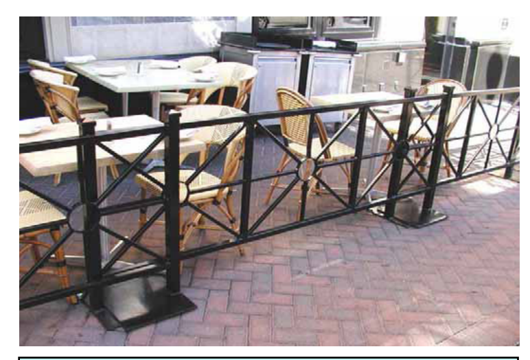
Figure 1. Acceptable fence with a decorative open design. It should be noted that per section 2-104, wicker chairs and serving stations are prohibited in Outdoor Dining and Seating Areas.

no alcohol is served. Such tables shall be limited to a dimension of 24 inches by 30 inches.