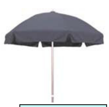
Figure 21. Example of a prohibited garden-style umbrella.