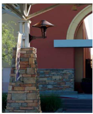
Figure 35. Permissable wall mounted Contemporary-style fixture