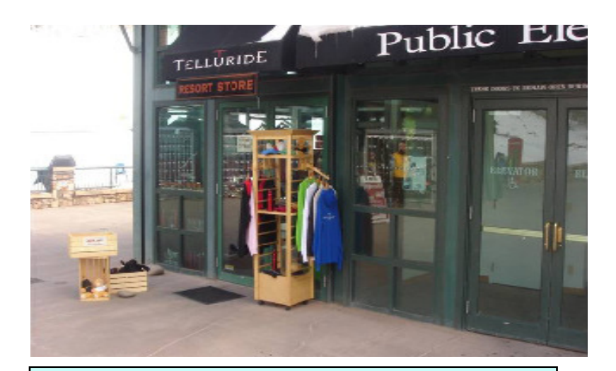
Figure 27. Well designed outdoor displays make the business more attractive to pedestrians.