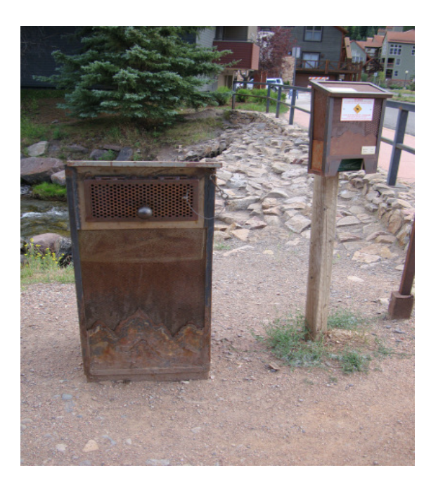
Figure 29. Bear proof recptacles shall be used in Plaza Areas.