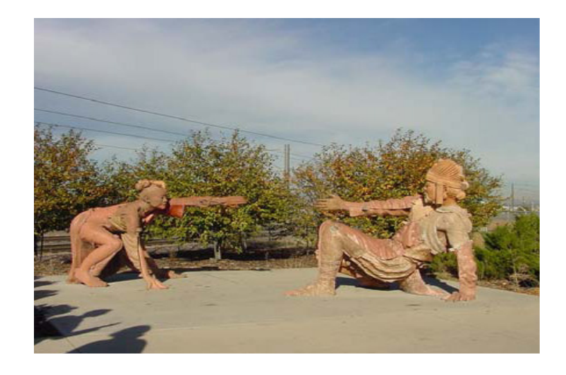
Figure 42. Public Art shall make a Plaza Area a more inviting place.