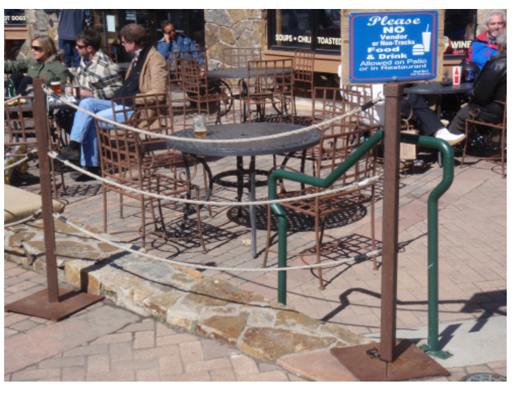
Figure 3. Barriers that are poorly constructed are prohibited.