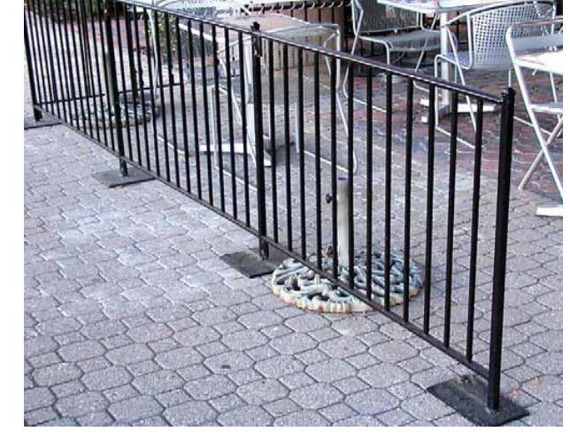
Figure 6. Acceptable wrought iron sectional fence.