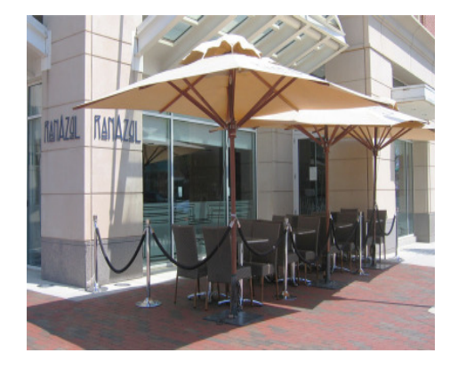
Figure 24. Example of a permissable freestanding umbrella that is not fixed to a table.