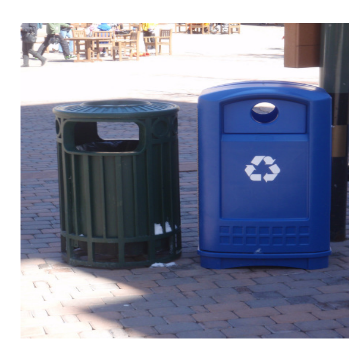
Figure 30. Non-bear proof receptacles are not permitted in Plaza Areas. In addition, the design of the recycling and trash receptables shall be consistent in design material and color.

2-203-6 Wall or tree mounted receptacles.