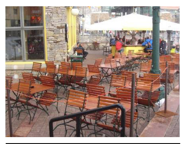
Figure 19. Attractive tables and chairs that use a mix of wood and metal material are permissable.