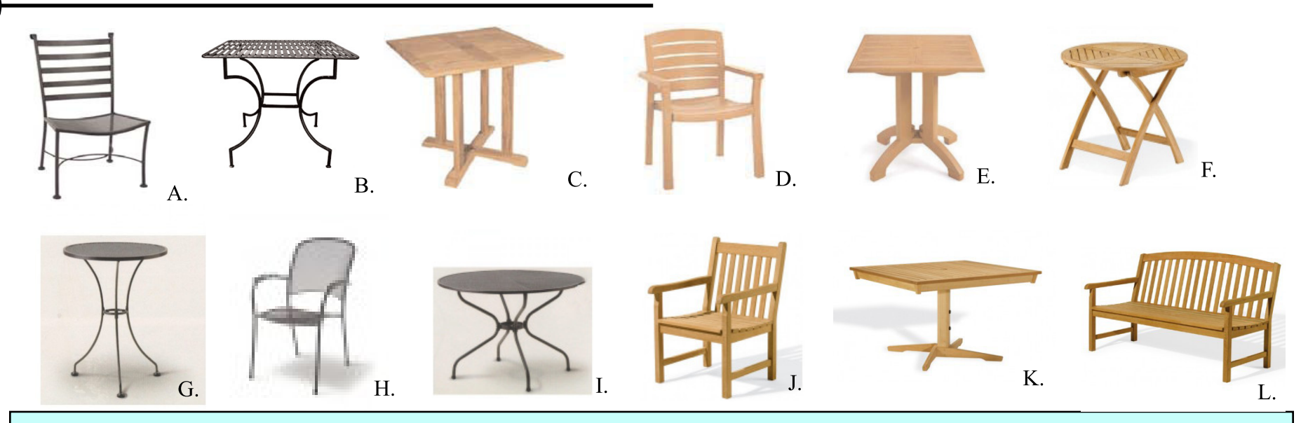
Figure 17. Representative examples of high quality furnishings include, but are not limited to, A. mesh iron patio chair B. folding wrought iron table C. teak table D. teak resin chair E. teak-resin table F. folding bistro table G. round mesh top table H. mesh patio arm chair I. round mesh top table J. classic wood arm chair K. wood pedestal table L. classic wood bench.