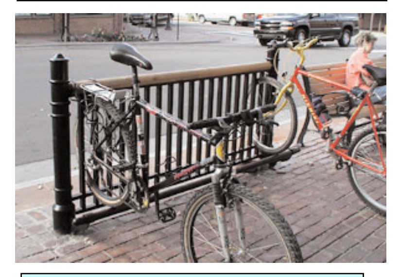
Figure 38. Example of a bicycle rack with a high quality design.