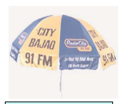
Figure 22. Example of too much advertising on umbrellas.