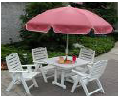
Figure 25. Example of a prohibited umbrella made of plastic and flouresamt colors.