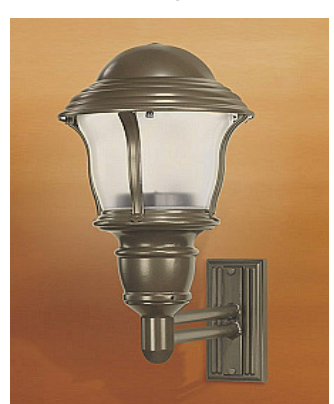
Figure 32. Permissable wall mounted Euro-style fixture.