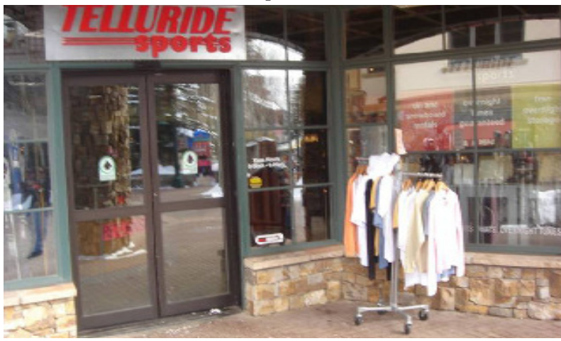
Figure 26. Clothes racks that display merchandise are encouraged.

interior display prior to permitting outdoor display.