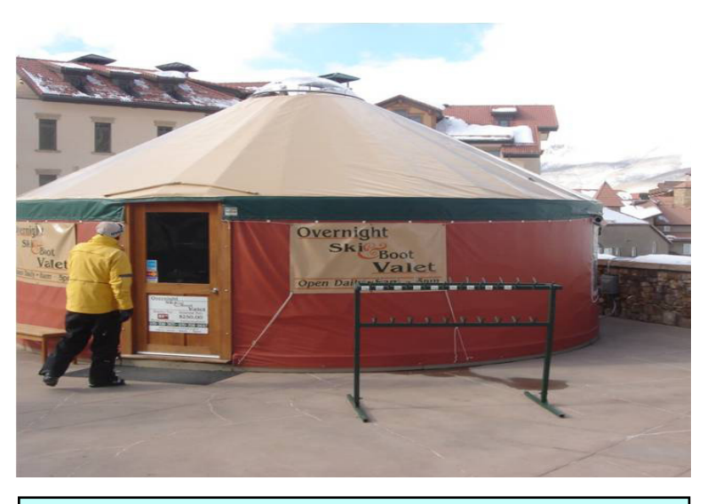
Figure 39. Tents and yurts are allowed as a Special Use.

2-207-3 Low quality materials such as plywood and PVC piping.