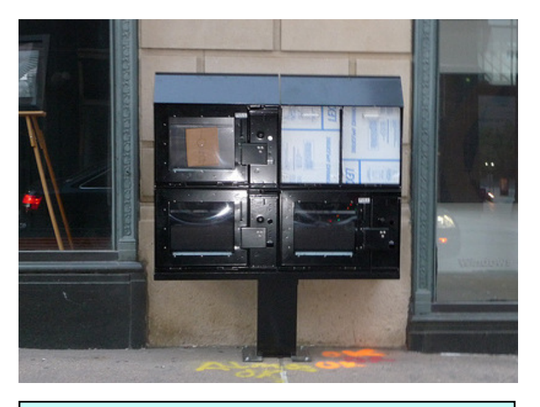
Figure 41. Media Racks shall be made of metal with clear panels and grouped together.