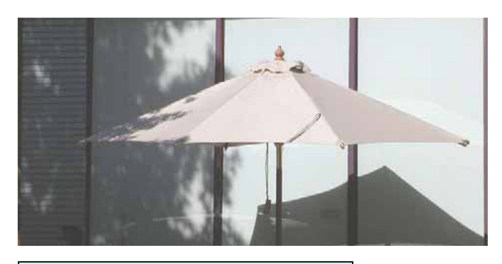
Figure 23. Example of a permissable market-style umbrella that has a canvas material and a solid natural earth tone.