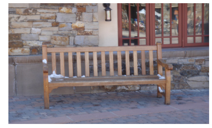
Figure 20. Attractive wood bench with back is permissable.