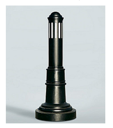
Figure 31. Acceptable bollard lighting.