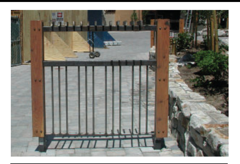
Figure 37. Example of a dual purpose ski and bicycle rack with a high quality design.