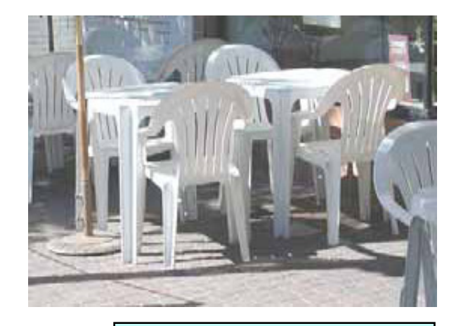
Figure 18. Plastic furniture is prohibited.