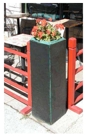
Figure 11. Planters are permitted outside the Barrier line if they are within the Barrier recommendations.