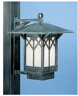
Figure 34. Permissable wall mounted prairie-style fixture with opaque glass