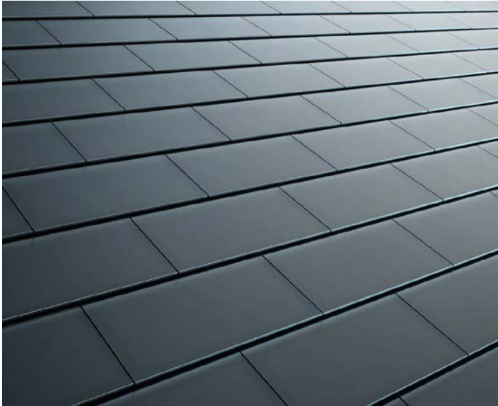
Solar Roof Tiles