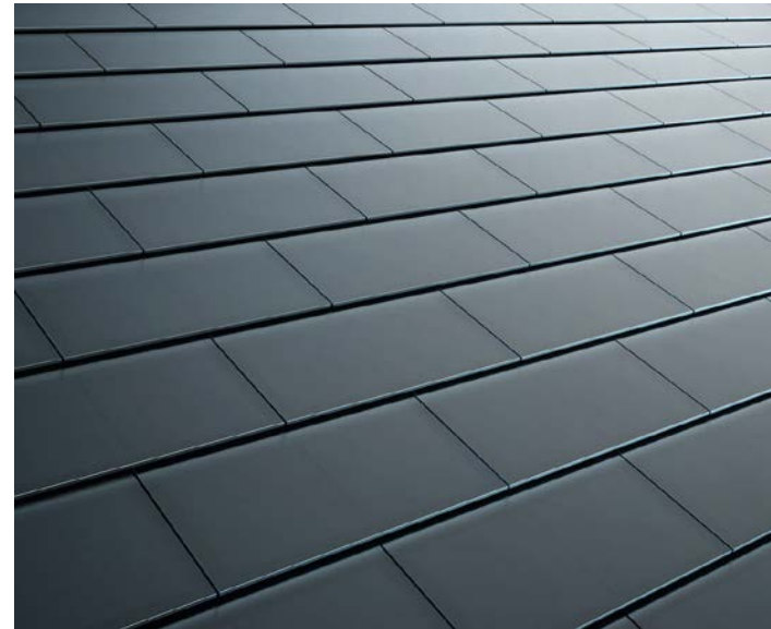
Solar Roof Tiles