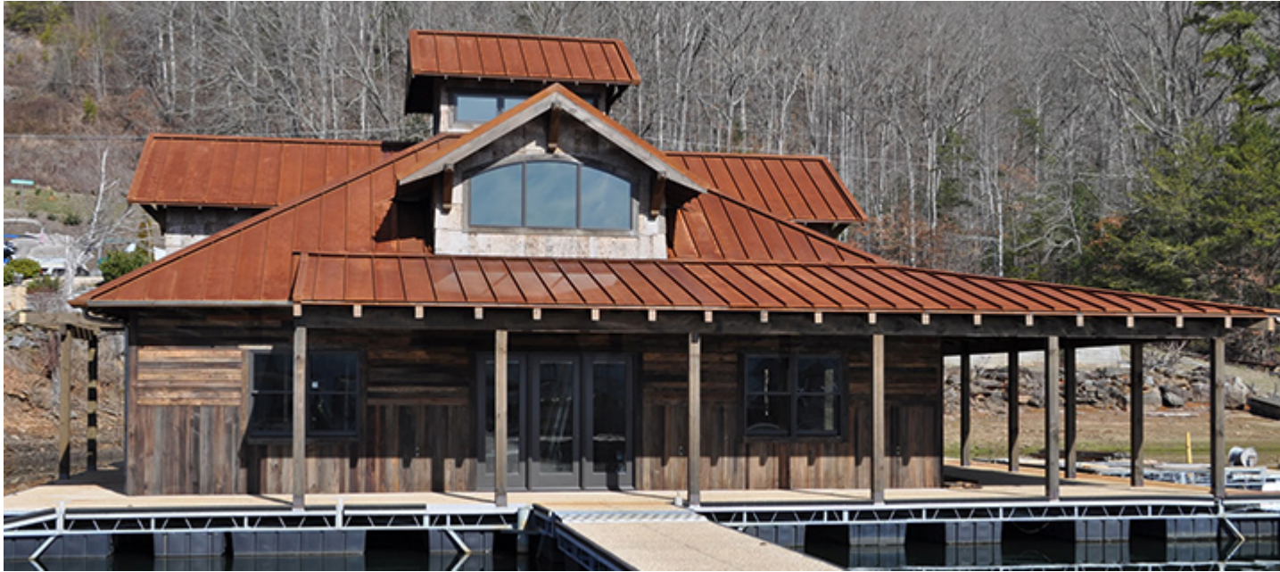
Rusted metal standing seam roof