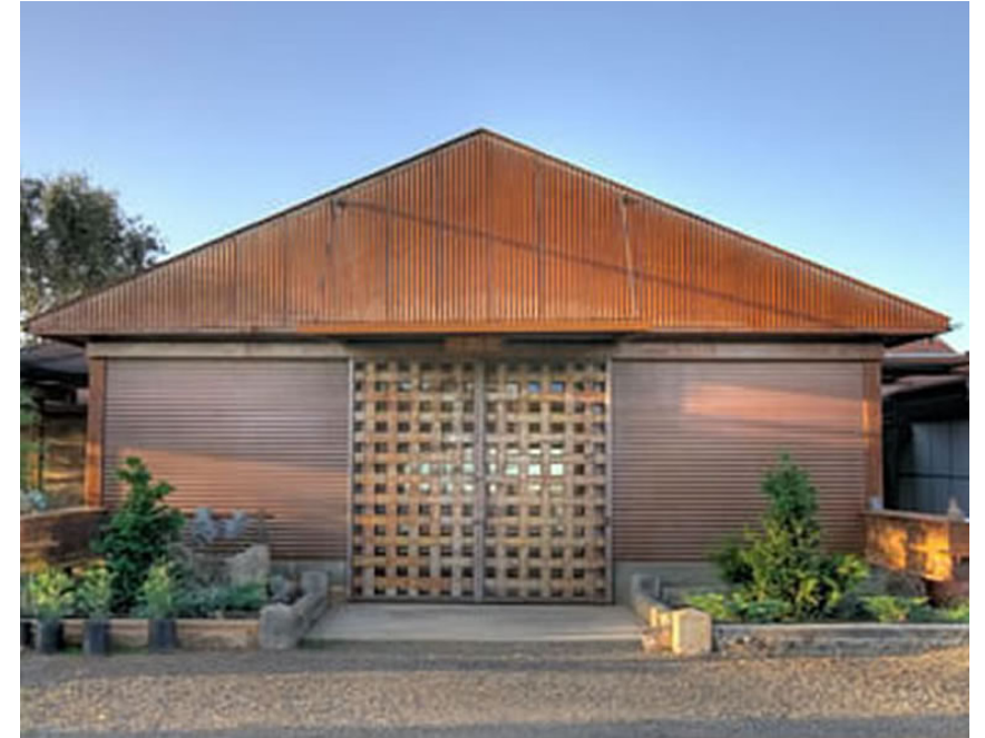
Rusted corrugated metal roof