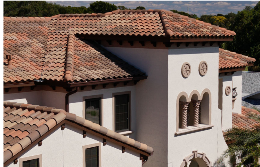
Concrete roof tile with variation within a palette