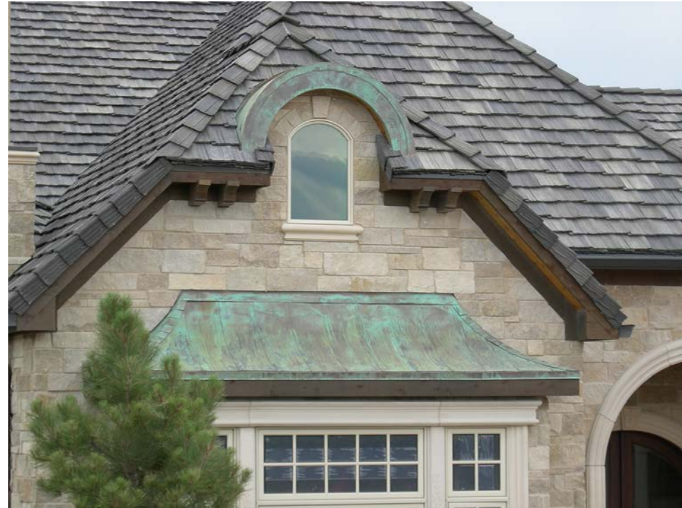
Verde Patina Copper – removed as a permitted patina