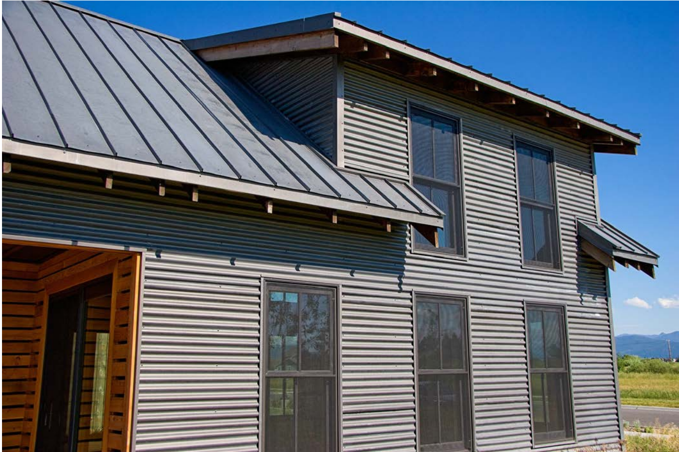
Bonderized gray standing seam metal