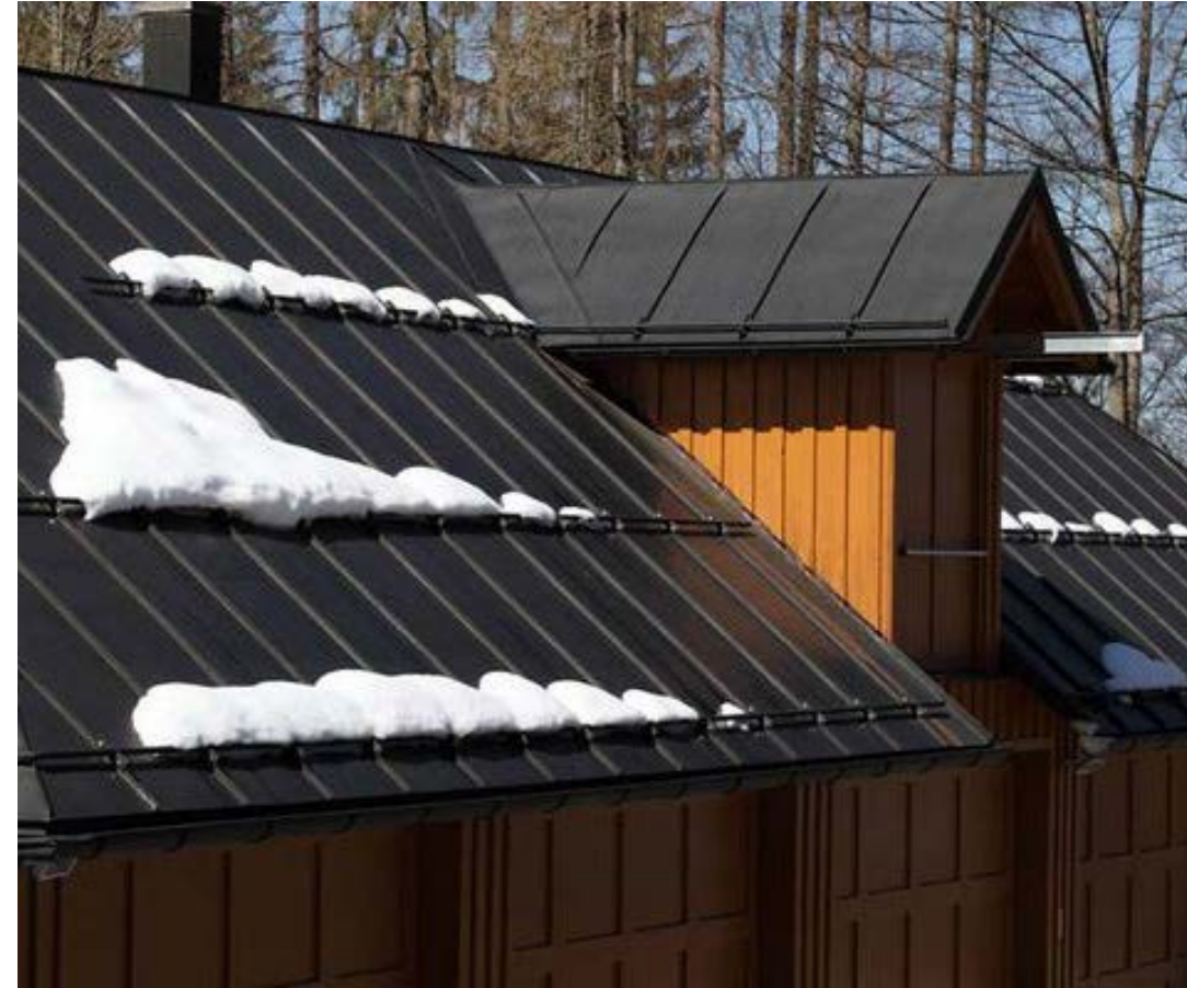
Black standing seam metal