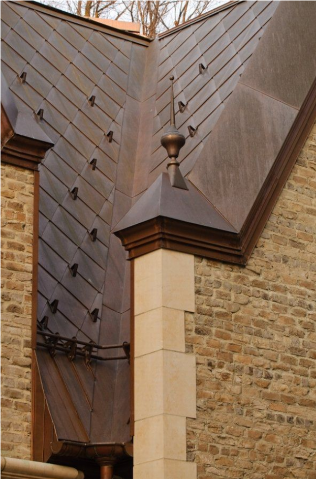
Brown Patina Copper