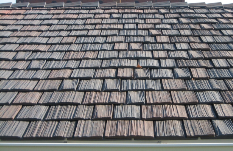
Synthetic Cedar Shake