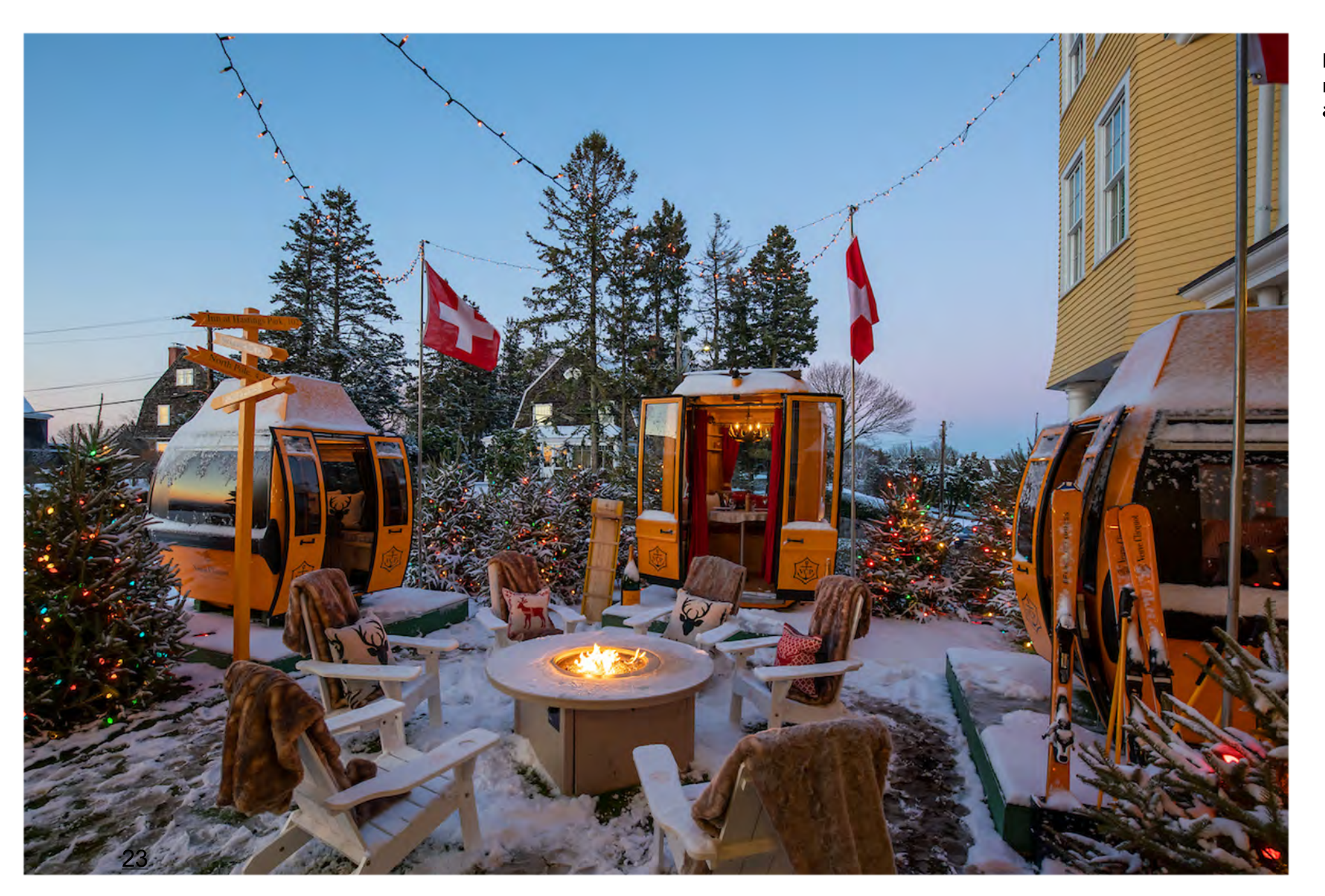
EXHIBIT C: Renderings of refurbished gondola cabins and glass structures