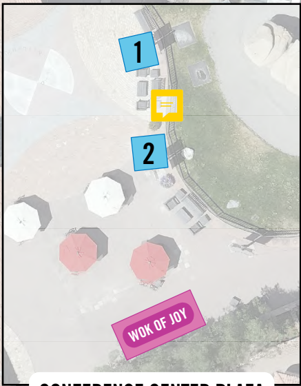
CONFERENCE CENTER PLAZA